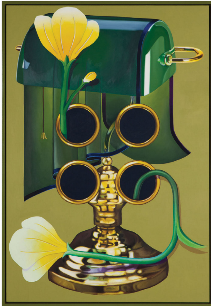
Orion Martin, Bakers Steak , 2015, oil on canvas, frame, 130 x 90 cm

the centre of the canvas, Martin has painted a square of four large metallic eyelets, sharper in focus than the lamp, slightly darker in hue, if still suggestive of brass, and reflecting a different lighting set up. Though a dark emptiness is glimpsed through these four apertures, they disclose a couple of lusty yellow cartoon flowers that hover just above the plane of the lamp and the trompe l'oeil eyelets and cast little drop shadows. Moving up from the monochrome ground, each layer in the work entails an increasing degree of 'realistic' representation, until the flowers emerge from the abyss, like something out of a psychedelic animation.