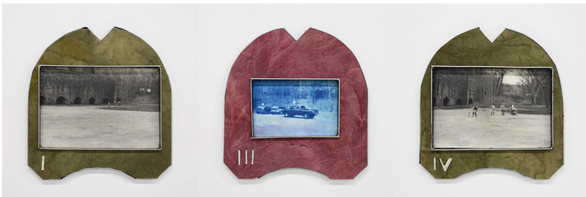
The Risk of Being Left Behind, 2017

And there was this really charged, kinetic feeling because of the crassness or rawness that can happen when you're working with your community members and it feels really safe—this queer female-bodied version of shop-talk, relative to these really strenuous material things we were doing. That's why I love working with metal, because it's so much more like the body than wood or any other material.