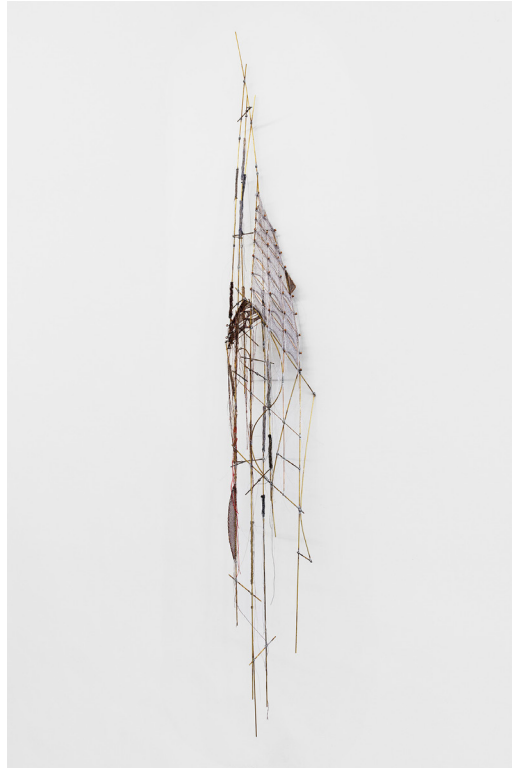
Covey Gong, NW298 , 2023, brass, tin, copper, assorted fibers, 193 × 28 × 17 cm.