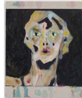
2 Kaoru Arima, Sunglass , 2016.