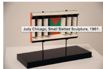
11 Judy Chicago, Small Slatted Sculpture , 1961.