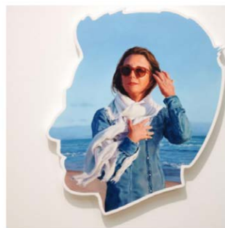
9 Alex Israel, Self-portrait mom , 2016. Acrylic and bondo on fiberglass, 243.8 x 213.4 x 10.2 cm.