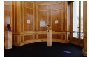
3 View of Sultana's booth at Paris Internationale.