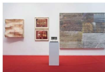
10 View of Jessica Silverman Gallery, FIAC, Paris, 2016.