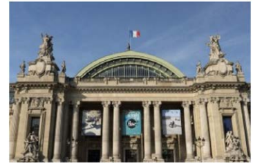
1 Exterior view of FIAC at the Grand Palais, Paris, 2016.