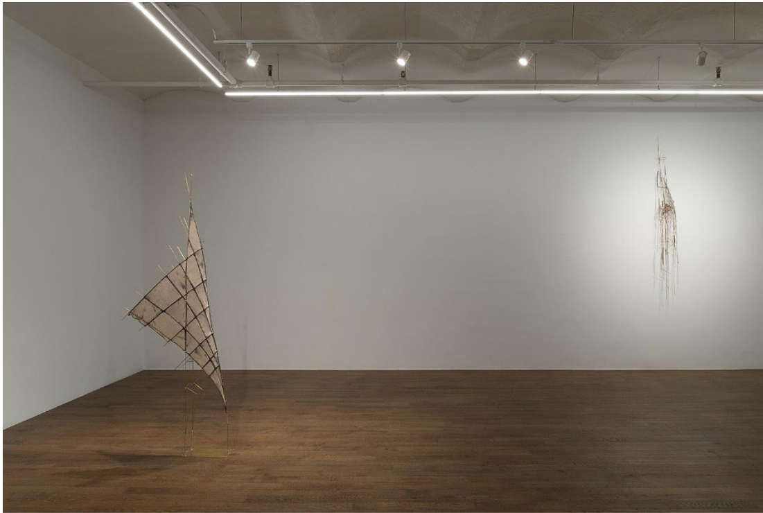
Installation view, Covey Gong: Intercontinental at Derosia, New York, 2023.

Max Heaton, Artefuse, September 23, 2023